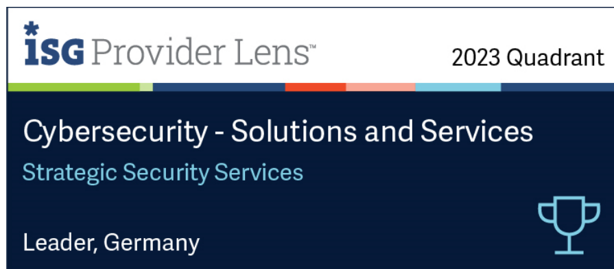
Caption: ISG ranks Axians top in Germany in the „Strategic Security Services“ category in the „Provider Lens™ – Cyber Security Solutions and Service Partners 2023“ benchmark.