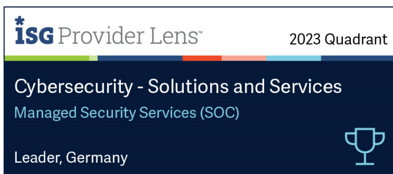
Caption: ISG ranks Axians top in Germany in the „Managed Security Services - SOC" category in the "Provider Lens™ - Cyber Security Solutions and Service Partners 2023" benchmark.