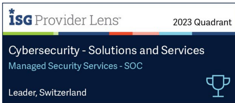
Caption: ISG ranks Axians top in Switzerland in the "Managed Security Services - SOC" category in the "Provider Lens™ - Cyber Security Solutions and Service Partners 2023" benchmark.