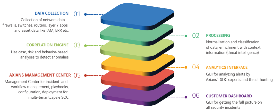
Levels of the Axians SOC platform

Axians supports you in mastering this convergence between IT and OT security while enabling you to remain competitive in your core business. Axians offers you a 360° SOC service, including integrating your OT environment in concert with our sister company Actemium. In its new dedicated IT/OT Security Operations Center in uptownBasel, Axians offers planning, implementation and integration in your infrastructure and 24/7 operation. At the core of our service is our platform: it enables us to adapt our actions to your needs. Continuous updates, integrated threat intelligence, and ongoing improvements and enhancements are included. From data collection and log data analysis to custom reporting in the customer dashboard — we offer a complete, end-to-end service.